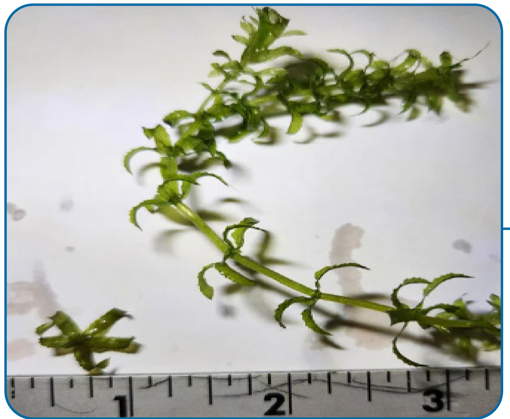
Photo: Lake Lillinonah Hydrilla

https://www.canr.msu.edu/news/spotlight_on_hydrilla_verticillata